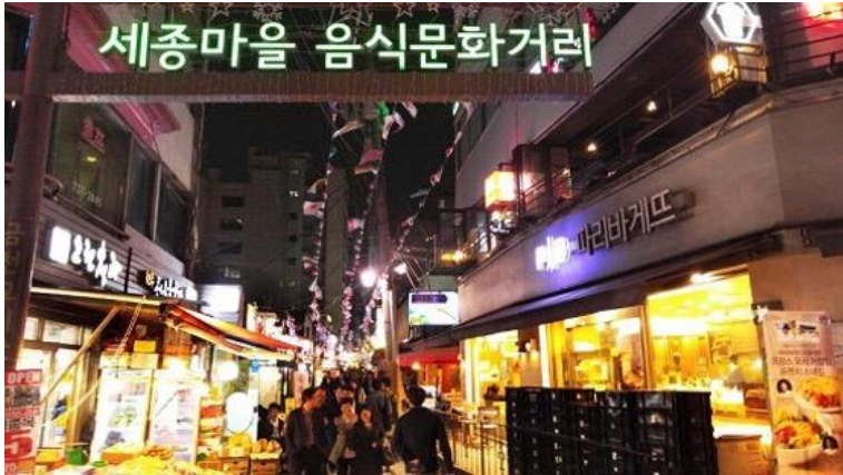
Picture of the Sejong Cultural Food Street Entrance

A five-minute walk from Gwanghwa-mun, Sejong Cultural Food Street is full of mouth-watering food of all kinds. CSIAMUN staff will guide participants through the street and dining options from Korean traditional meals to the more familiar franchises.