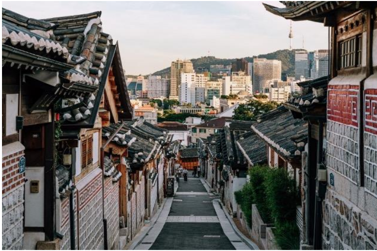
Scenery of Bukchon Hanok Village

Bukchon Hanok Village is home to many Hanoks , the traditional Korean house. Located at the center of the busy Jongno-gu, it is a well-known tourist attraction. CSIAMUN staff will assist in exploring this mecca of Korean traditions.