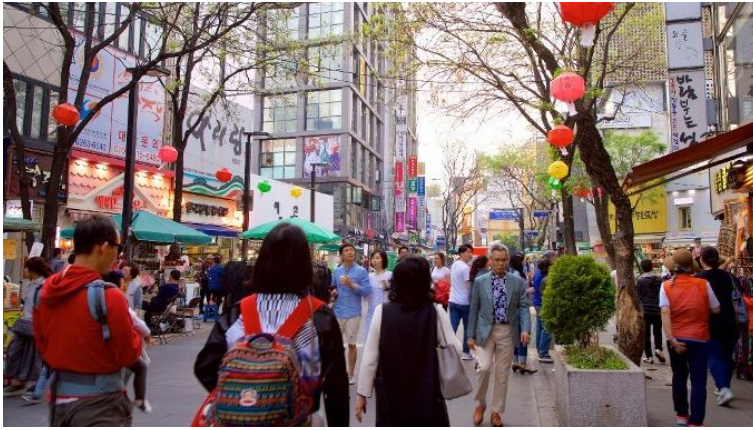
Insa-Dong Culture Street

Insa-Dong Culture Street, another renowned tourist spot, is full of souvenir shops, as well as recreational spots. The main street where no cars are allowed is great even just to walk through.