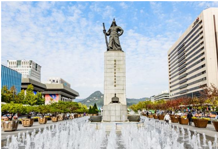
Statue of Admiral Yi Sun-sin

Gwanghwamun Square, a Seoul landmark, is known for its view of the magnificent Gwanghwa-mun and the two statues of Korea's greatest heroes – Admiral Yi Sun-sin and King Sejong.