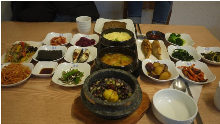
Bukchon Yeonnip-Bap Meal

A staple for locals, Yeonnip-Bap is glutinous rice, dates, and chestnuts wrapped in lotus leaf and then steamed. This dish was originally eaten mostly by monks, but it is now a popular food for all of Korea.